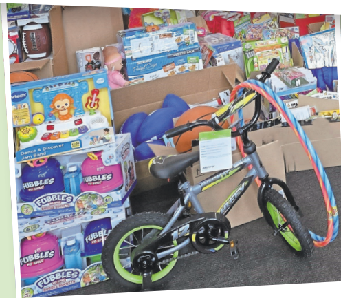
Toy Drive Donations