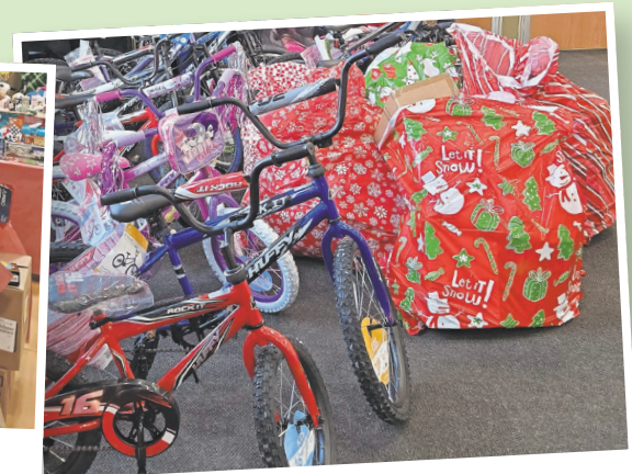
Bike and Gift Donations