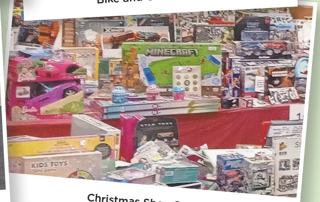
Christmas Shop Setup