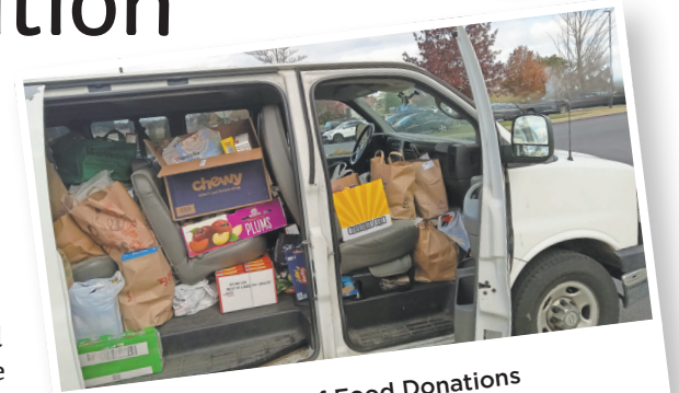
Van Full of Food Donations

Volunteers worked together to pack and deliver food boxes directly to the cars of families in need. Through teamwork and love, physical needs were met and hearts were touched.