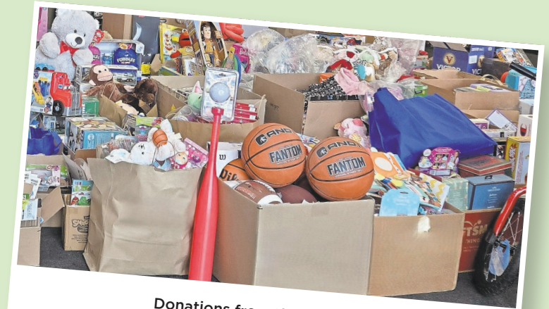
Donations from the Toy Drive

their time, resources, and support. Together, the community worked to ensure that every child felt special during the holiday season.