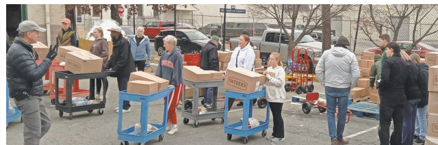
Volunteers at the Food Box Distribution