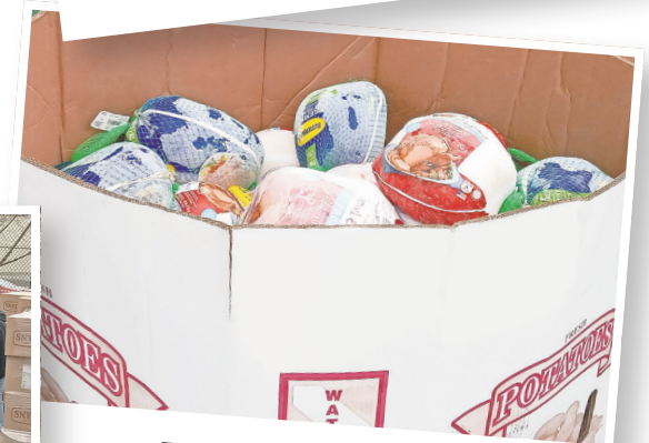
Turkeys for Distribution