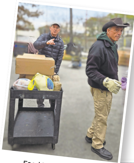
Food Box Distribution

Your generous support through food donations and volunteering made it possible to provide close to 1,400 Thanksgiving food boxes to families in need this year. On Monday, November 3 , volunteers answered phones at Sunday Breakfast Mission during the annual call-in days, helping families reserve their Thanksgiving food boxes.