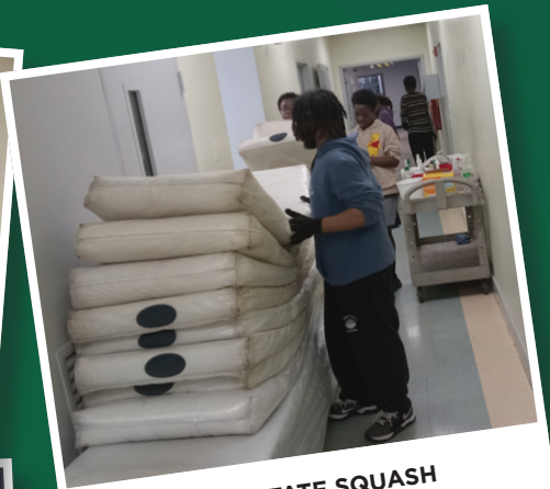
FIRST STATE SQUASH