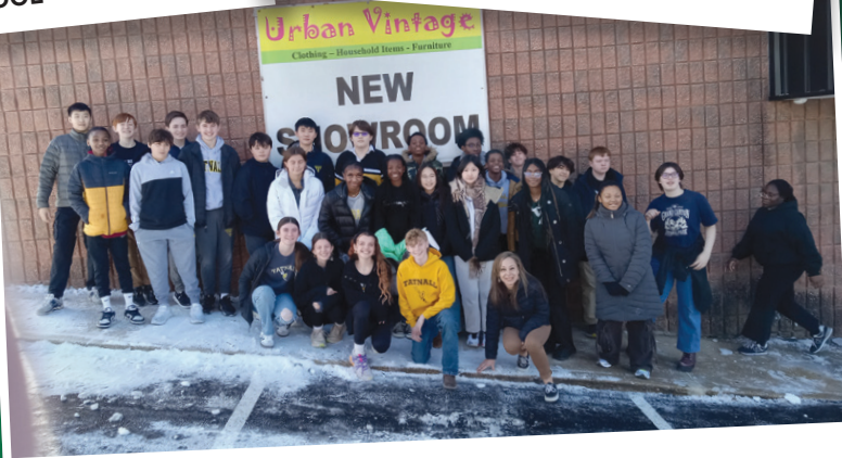
THE TATNALL SCHOOL