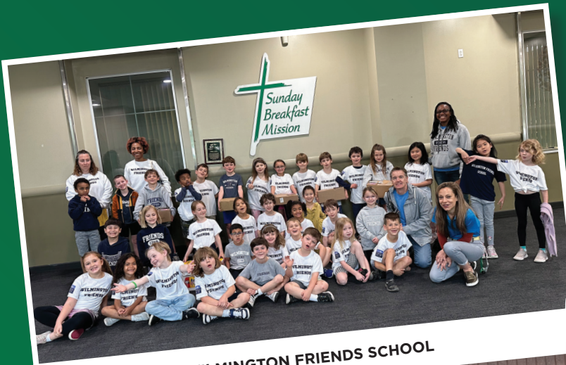
WILMINGTON FRIENDS SCHOOL