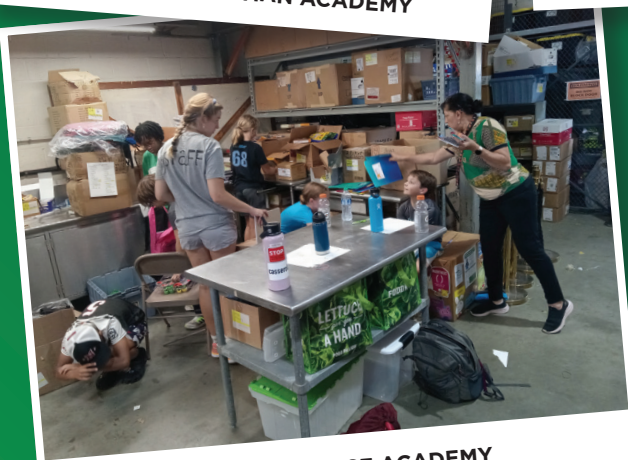
URBAN PROMISE ACADEMY