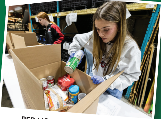
RED LION CHRISTIAN ACADEMY