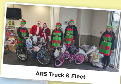
ARS Truck & Fleet