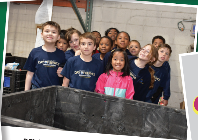
DELAWARE VALLEY CLASSICAL SCHOOL